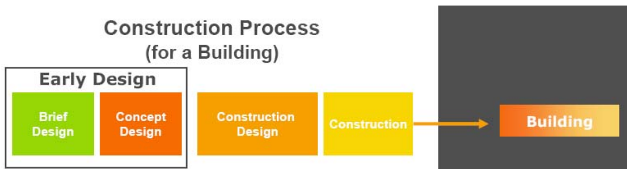
Figure 1: Construction process for a building (source: Pfitzner et al., 2007).

Subtask B deals with methods and tools for solar design that architects use at early design phase (EDP). Whilst the term “early design phase” is very commonly used in discussing the building design process, it invariably refers to the stage of work where initial design ideas are being conceptualized in tandem with the formulation of the building project requirements [Lam, Chun Huang & Zhai, 2004]. It is generally recognized that this is an adaptive-iterative process [Mahdavi & Lam, 1993 via Lam, Chun Huang & Zhai, 2004]. However, it is often not clear in practice when this phase ends and the next begins [Lam, Chun Huang & Zhai, 2004]. According to Pfitzner et al [2007], the “Early Design Phase” (EDP) starts with the first client contact and ends with a design with recognisable functions, visualised for easy understanding and with a cost calculation to support the client’s “go/no-go” decisions. This is illustrated in figure 1.